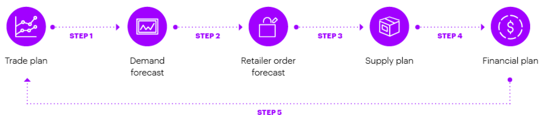
Figure 1: A five step circular process for demand planning

Compared with consensus forecast--where each functional area generates its own forecast and executives need to agree on a compromise--the circular process is all about a single forecast generated throughout the process. It starts with the data described in Table 1 and applies advanced analytics in every step. Thus, the process is mostly automated and the role of executives is to agree on the data while letting the machine generate the prediction.